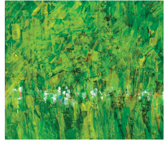
Fields and Prayer Flags

“This series of paintings depict nature and the Bhutanese landscape. We traveled all over the country and witnessed abundant unique topography. The paintings are inspired by the areas we visited, and each shows the colors of the different regions.”