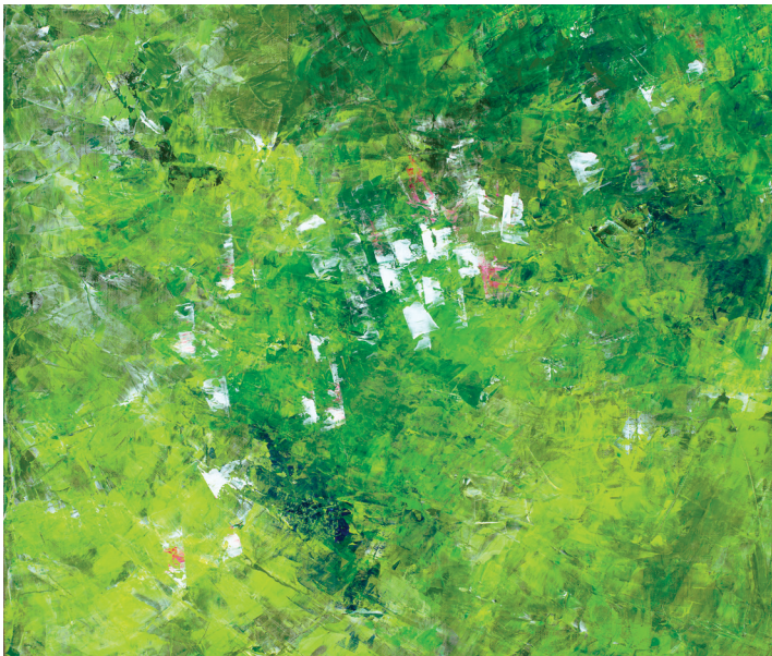
Prayers Over Rice Fields

“ Bhutan September was inspired by the trees in the nation’s capital, Thimphu; Prayers Over Rice Fields and Rice Fields by the tiered rice terraces of the Punakha Valley; Prayers Afloat by the iconic Tiger’s Nest, in Paro. The last painting in the series, Joy , reflects the overall spirituality and culture of Bhutan.”